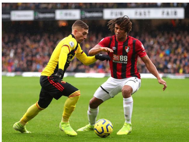
Nathan Ake in Action against Watford